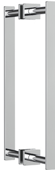
Double Door Handle